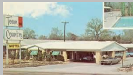
Town and Country Inn